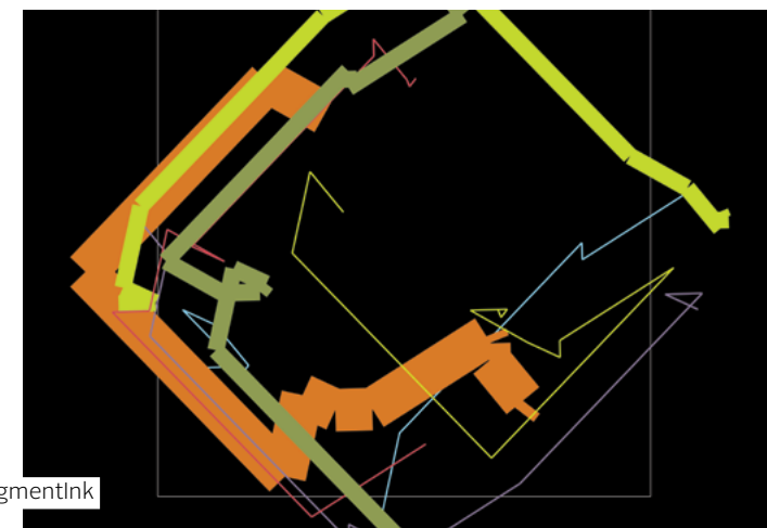
From klangfarben , 2007, Manfred Mohr. PigmentInk on paper 40cm x 40cm.