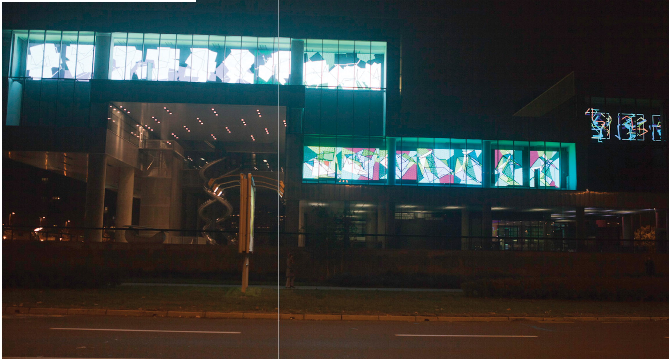
From Space.color.motion , 2002, Manfred Mohr. Media Facade of the Museum of Contemporary Art, Zagreb.