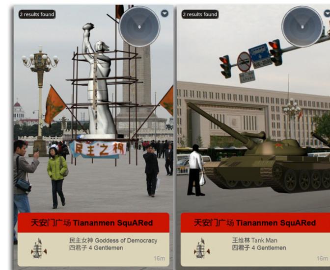
Figure 3. Tiananmen SquARed: Goddess of Democracy and Tank Man , 4Gentlemen, 2011. Augmented reality public art. Screenshot by 4Gentlemen. © 4Gentlemen, 2011. Used with permission.

visualize the scope of the loss of life by marking each location where human remains have been recovered along the border and in the surrounding desert.