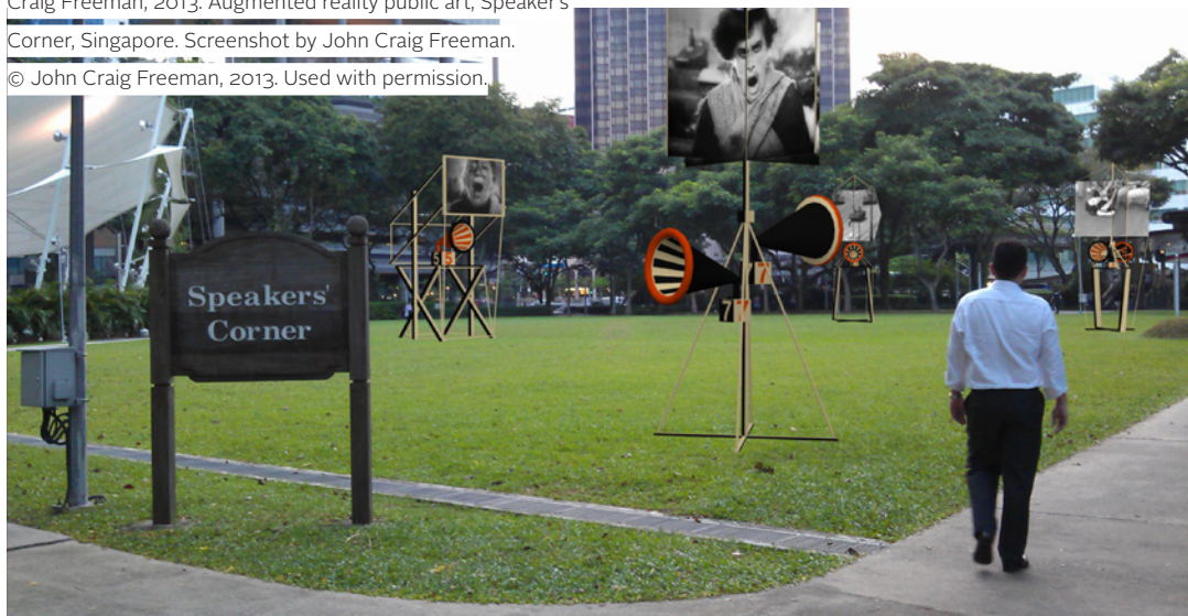
Figure 1. Orators, Rostrums, and Propaganda Stands , John Craig Freeman, 2013. Augmented reality public art, Speaker's Corner, Singapore. Screenshot by John Craig Freeman. © John Craig Freeman, 2013. Used with permission.

Whereas the public square was once the quintessential place to air grievances, display solidarity, express difference, celebrate similarity, remember, mourn, and reinforce shared values of right and wrong, it is no longer the only anchor for interactions in the public realm. Public discourse has been relocated to a novel space; a virtual space that encourages exploration of mobile location based public art. Moreover, public space is now truly open, as artworks can be placed anywhere in the world, without prior permission from government or private authorities – with