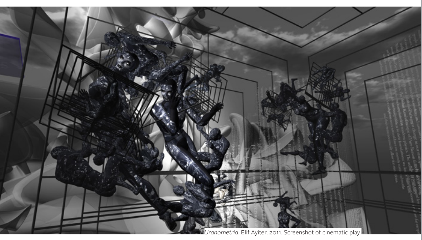
session in Second Life.