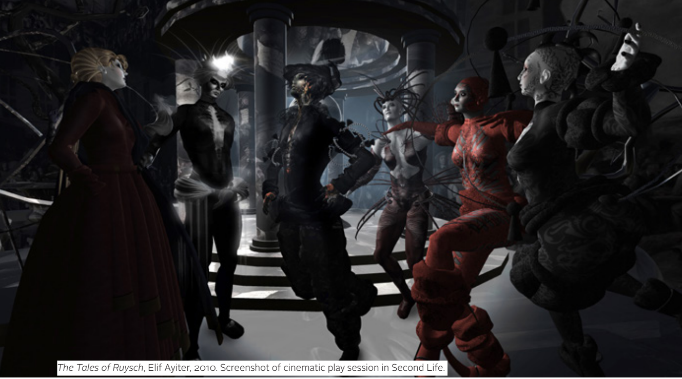
© Elif Ayiter, 2010. Used with permission.

poses human society, and animals have not waited for man to teach them their playing," from which it would appear to follow that the intrinsic nature of Play for Huizinga is quite intangible: Biological conditions appear to be insufficient for explaining behavior that is as extraordinary and as idiosyncratic as Play is as a natural or as an instinctive state; since nature, he says,