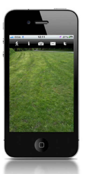
WalkSpace, 2011, Conor McGarrigle, iPhone App. © Conor McGarrigle.

120 LEONARDOELECTRONICALMANAC VOL 19 NO 1 | ISSN 1071-4391 | ISBN 978-1-906897-20-8 | ISSN 1071-4391 | ISBN 978-1-906897-20-8