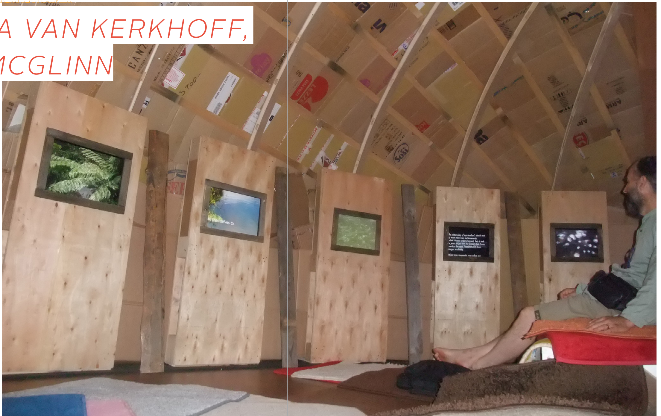
Kāinga a roto (Home Within) , 2011, Sonja van Kerkhoff, Sen McGlinn. Interior view. The following video link http://youtu.be/XRSLvY-6qwE gives an overview of the process of collecting the materials from the street and the construction of the installation.