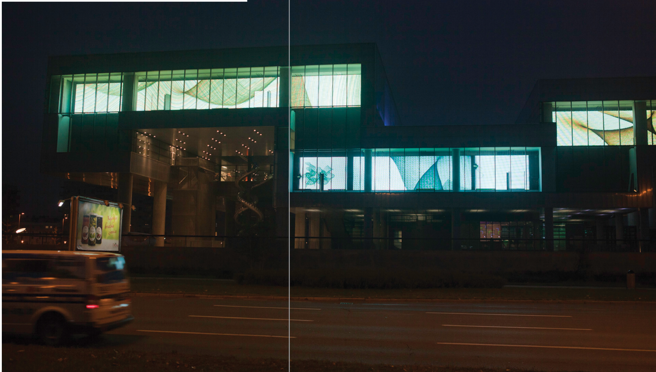
Green Cloud for a Three Story Drawing Machine, 2011, Roman Verostko. Media Facade of the Museum of Contemporary Art, Zagreb.