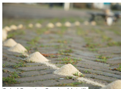
Spiral Drawing Sunrise (detail). (Close-up of sand spiral, drawn by solar powered robot.)

Spiral Drawing Sunrise (detail). (Test run, the solar cart passes its starting point.)