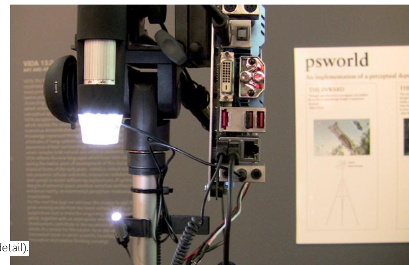
psworld –The Inward (detail).