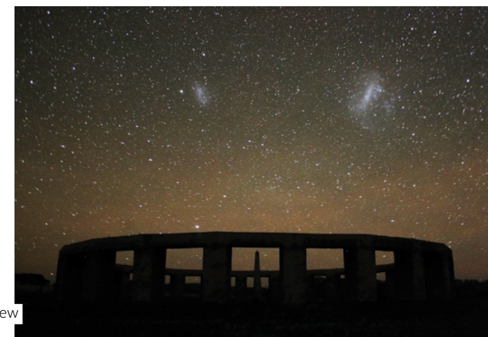
Stonehenge, 2008, Paul Moss. Aotearoa, New Zealand.