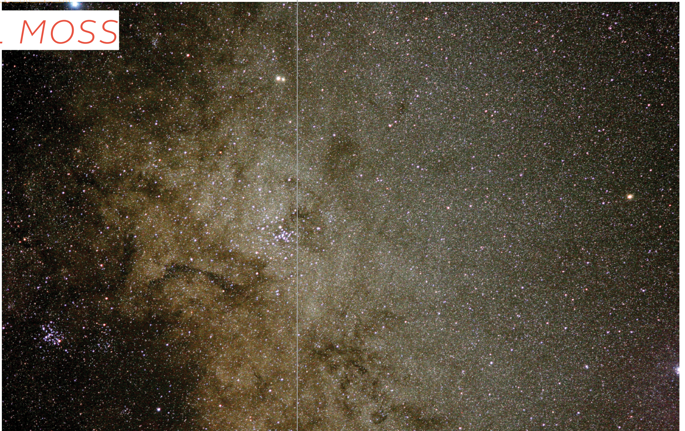
Clusters M6 Butterfly Cluster – NGC 6383 M7 Open Cluster – NGC 6475, 2010, Paul Moss.