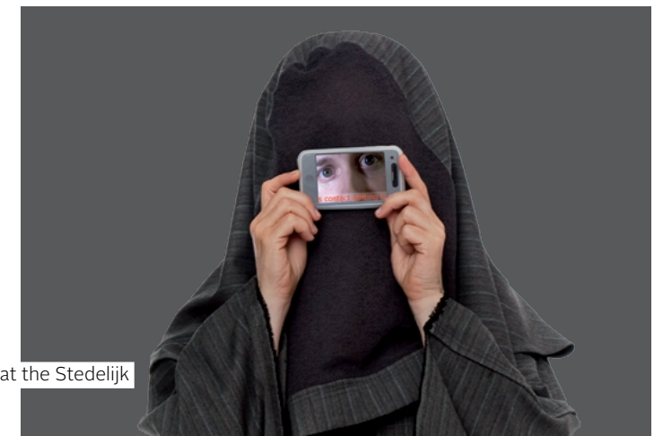
Tele_Trust (performance-installation at the Stedelijk Museum Amsterdam).