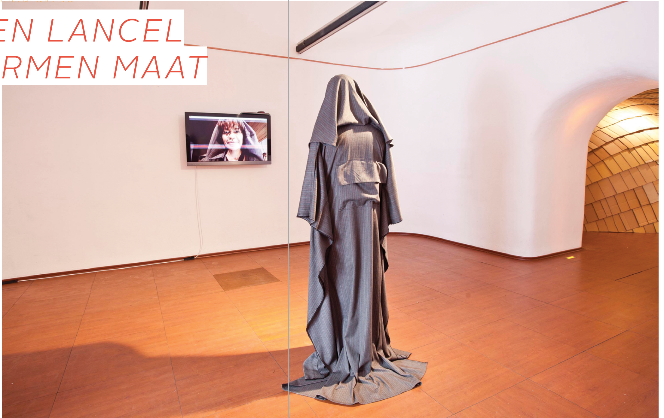
Tele_Trust , 2011, (performance-installation at the Uncontainable exhibition, ISEA2011 Istanbul).