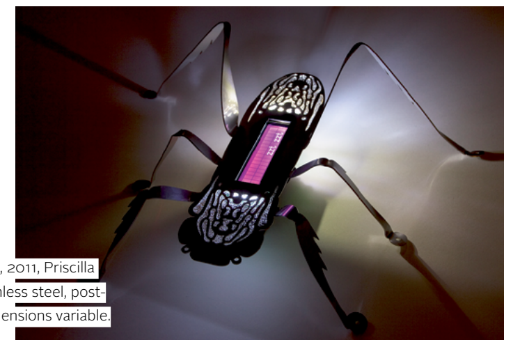
Suzumushi: The Silent Swarm (detail), 2011, Priscilla Bracks and Gavin Sade, laser-cut stainless steel, post-consumer plastic and electronics, dimensions variable.