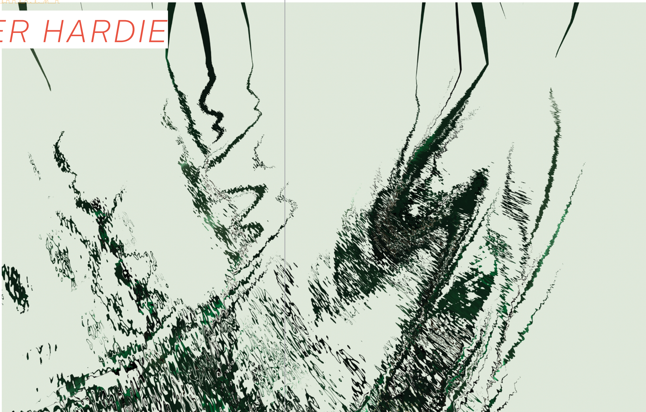
Ripple_flat_four , 2011, Peter Hardie, print generated using a computer animation system, 74 x 42 cm.