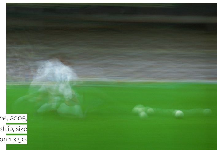
I'll walk alone - you'll never walk alone , 2005, Sigune Hamann. Photographic film-strip, size variable, proportion 1 x 50.