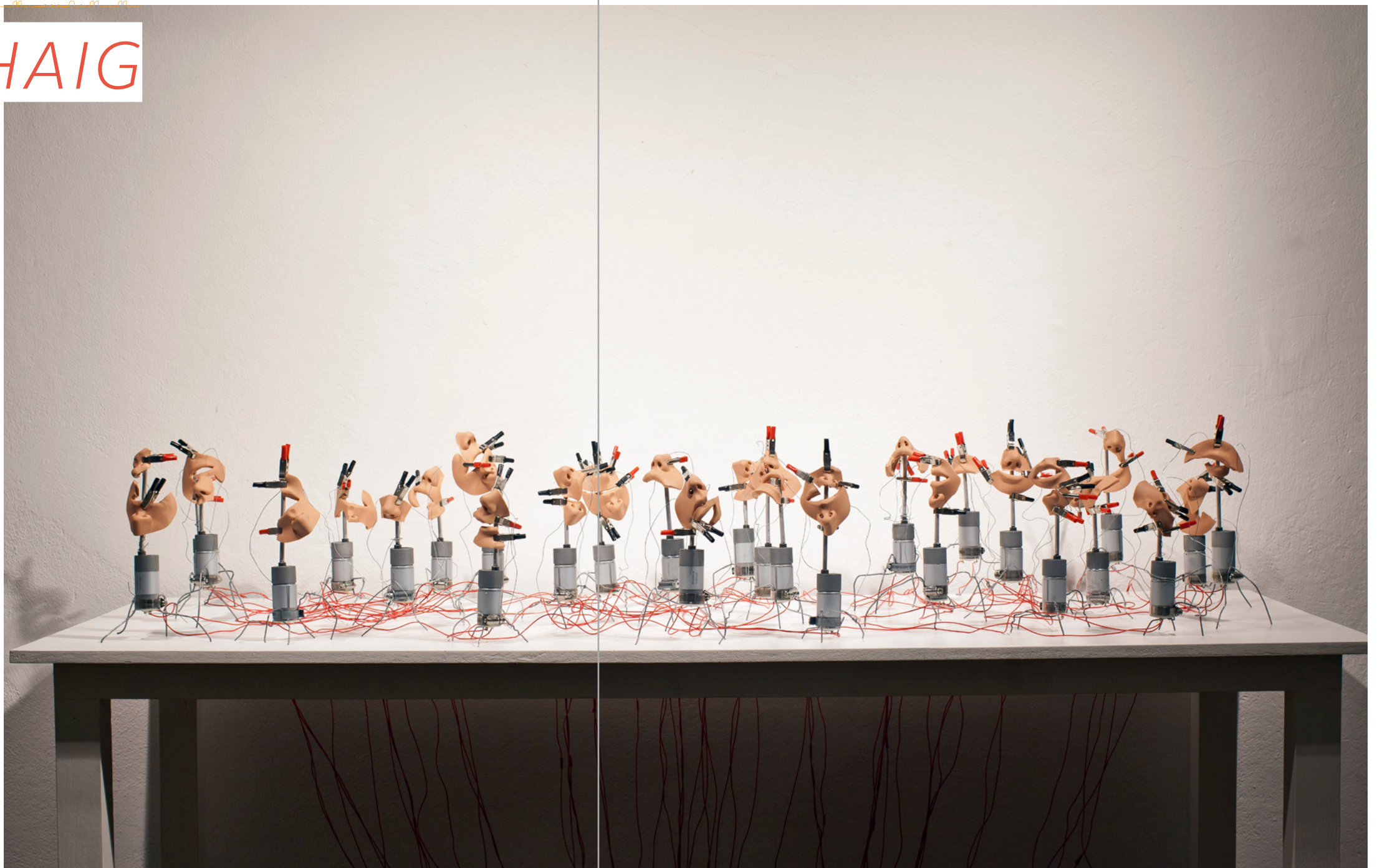
Twitch Of The Death Nerve , 2011, Ian Haig, kinetic sculpture.