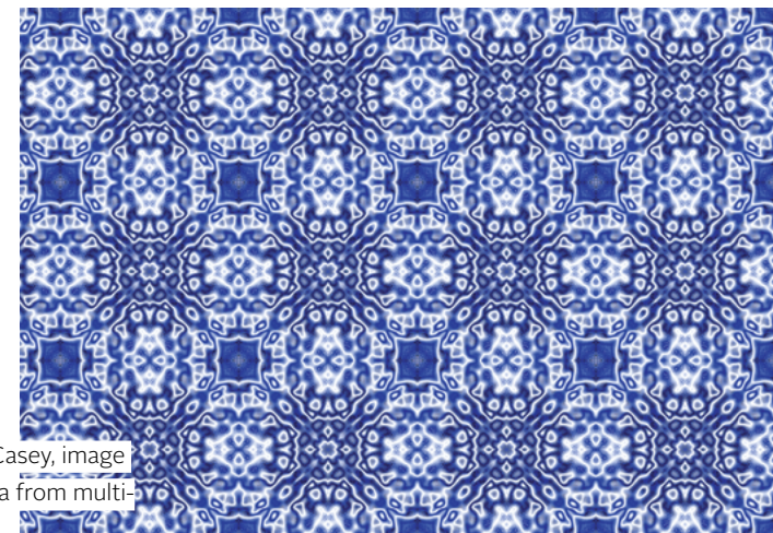
Meditation Wall (detail), 2011, Karen Casey, image capture of brainwave generated media from multi-channel video, 200 x 600 cm.