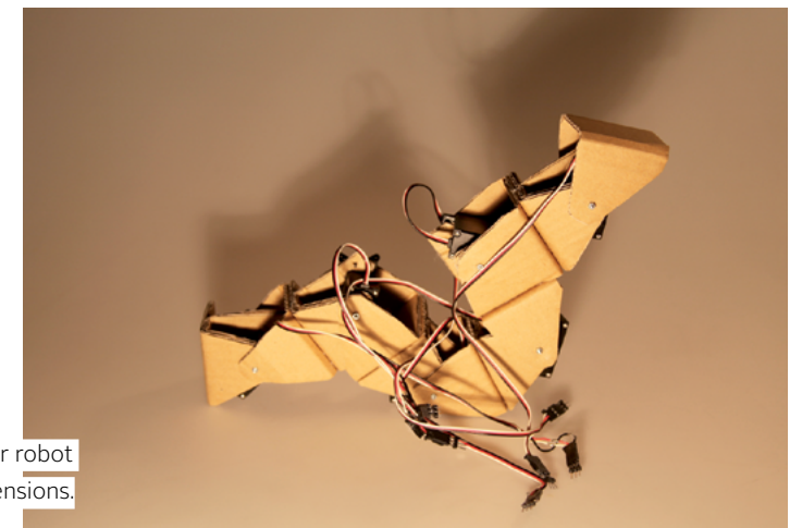
Fragment , 2010, Kirsty Boyle, modular robot (electronics, cardboard) variable dimensions.