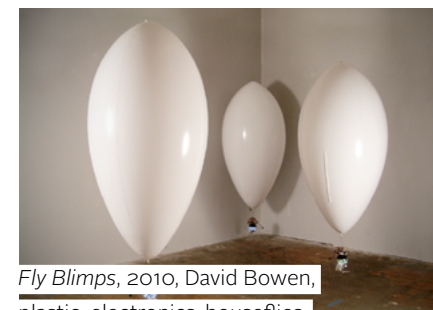
Fly Blimps , 2010, David Bowen, plastic, electronics, houseflies, helium, dimensions variable.