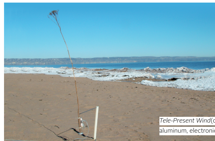
Tele-Present Wind (detail), 2010, David Bowen, plastic, aluminum, electronics, tansy, dimensions variable.