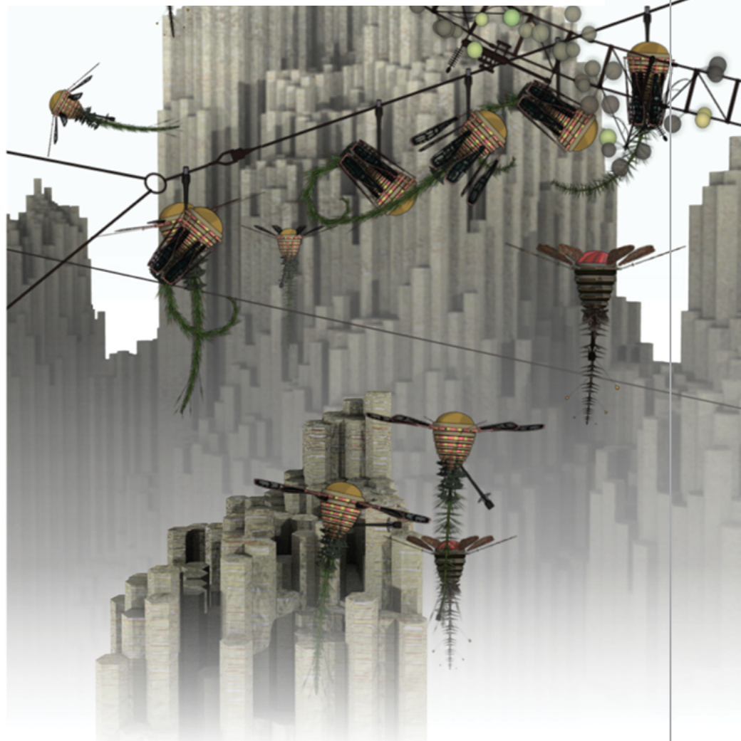
Lost Calls of Cloud Mountain Whirligigs (view 2, left & right), 2010, boredomresearch, detail from software artwork, 60 x 49 x 2 cm.