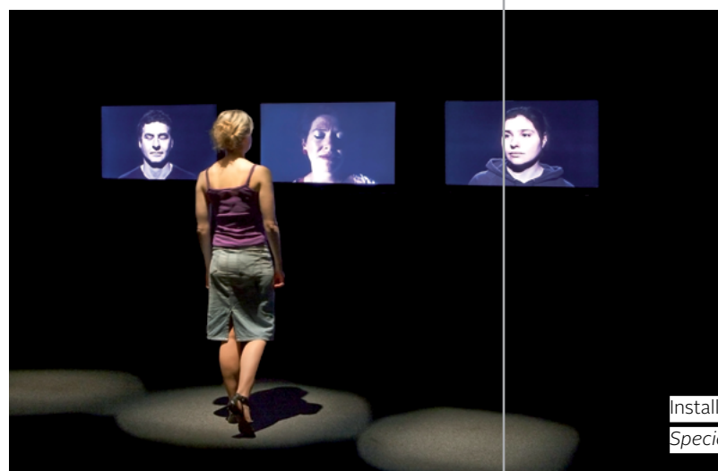
Installation view of Chameleon 07 , Superhuman, Revolution of the Species , RMIT Gallery, Melbourne Australia.