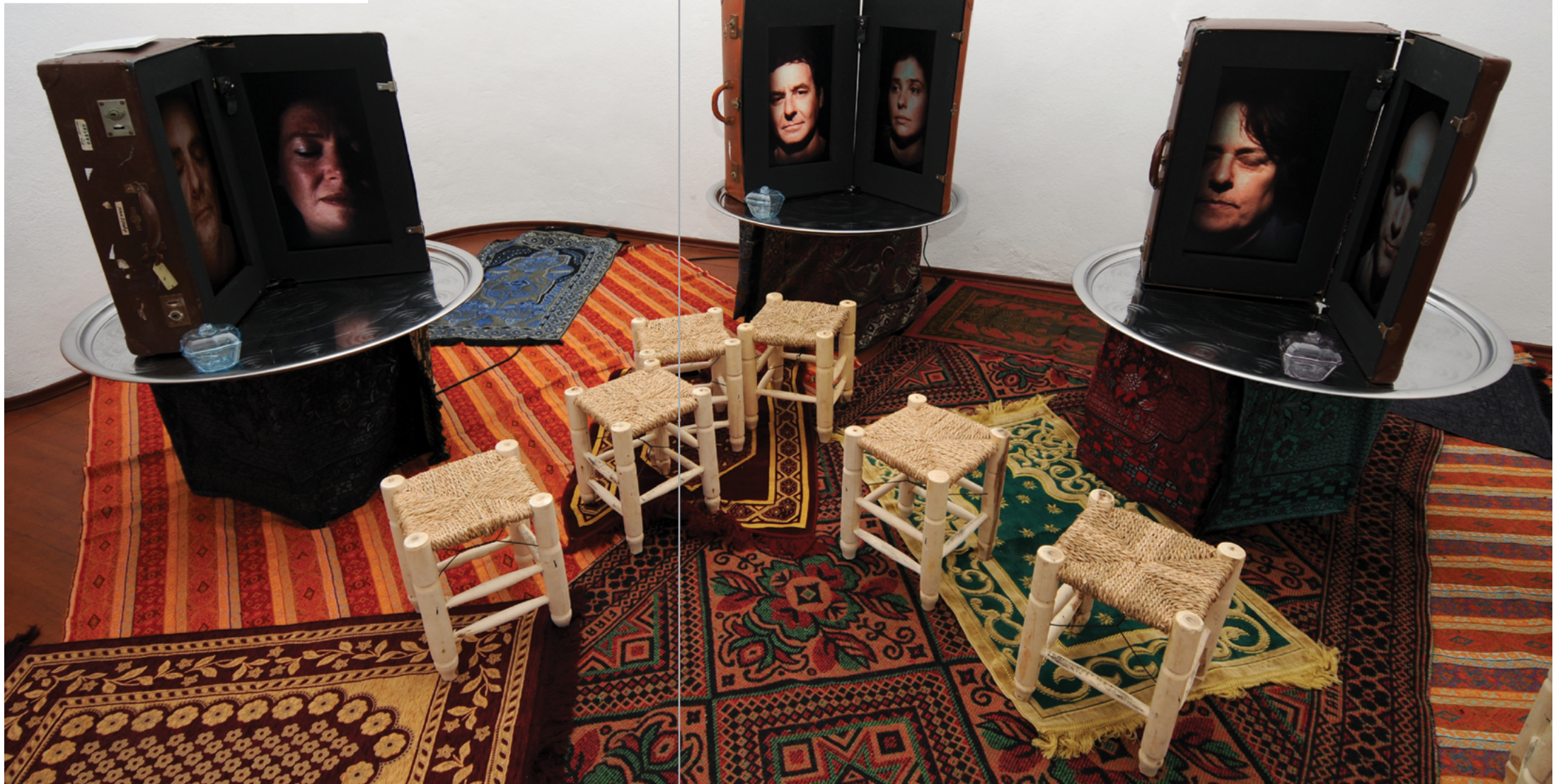
Chameleon , 2009, Tina Gonsalves. Installation view of Chameleon 09 , Fabrica, Brighton, UK.