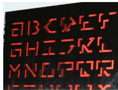
Figure 3: The same font as above printed beneath a lenticular lens for the production of floor graphics © Matthias Hillner, Royal College of Art, London, 2004

In his introduction to ‘dimensional typography’ Abbott Miller refers to “sculptural and three-dimensional forms of individual letters” as an alternative to “the spatial disposition of ‘flat’ letterforms” as they occur in information landscapes [8]. This kind of dimensional typography, I claim, opens up new possibilities in the context of digital communication. If used for animation purposes, virtual three-dimensional letterforms may emerge from and merge into illegible visual elements. I refer to virtual letterforms in this case; as such animated three-dimensional text patterns cannot exist outside the digital sphere.